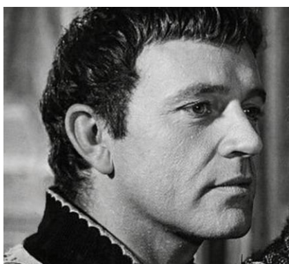
4 Richard Burton