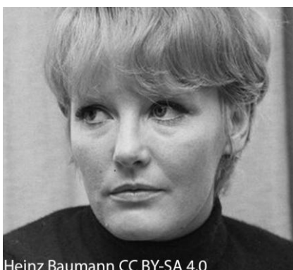
5 Petula Clark