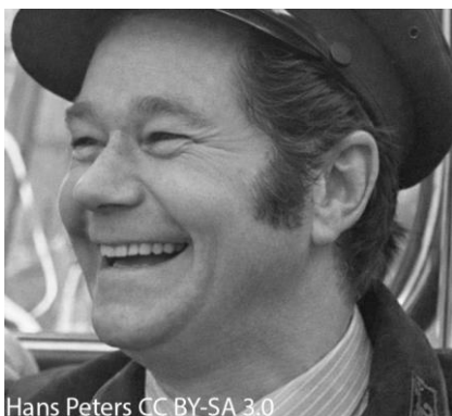
2 Reg Varney