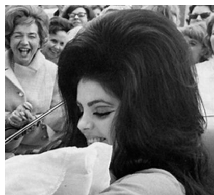
9 Priscilla Presley