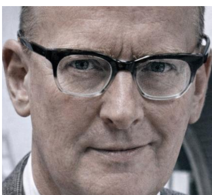
11 Arthur C. Clarke