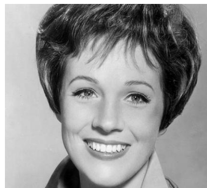
3 Julie Andrews