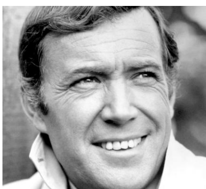
10 Val Doonican