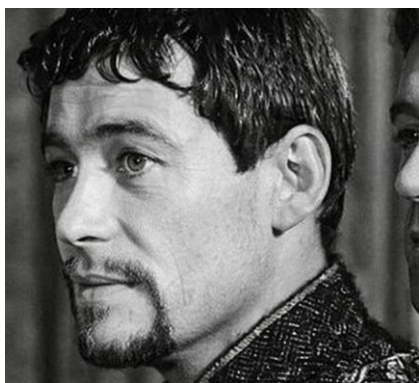
1 Peter O'Toole