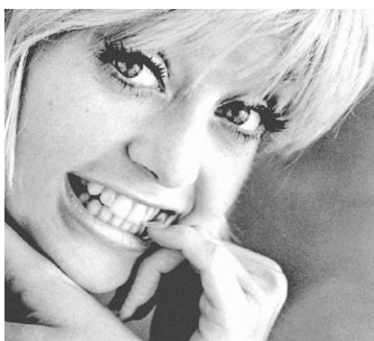
7 Goldie Hawn