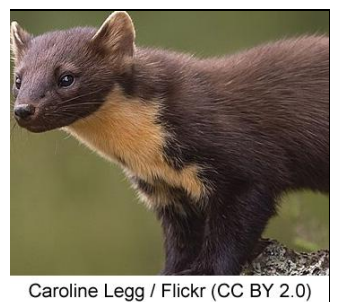
20 Pine Marten