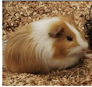
3 Guinea pig