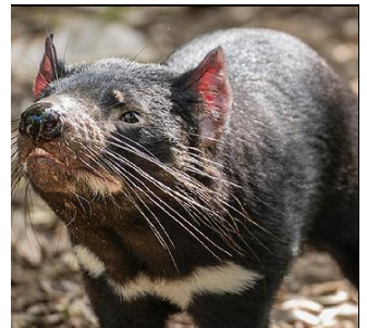
12 Tasmanian Devil