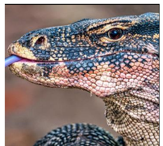
16 Komodo Dragon