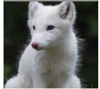
8 Arctic fox