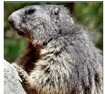
12 Groundhog also known as a Woodchuck