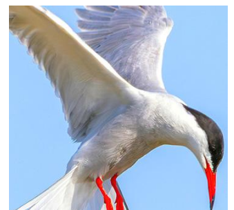
16 Arctic Tern