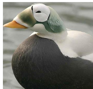
11 Eider Duck