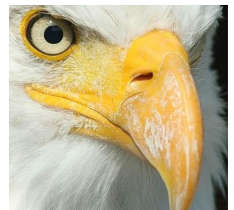
12 Bald Eagle