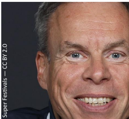
4 Warwick Davis