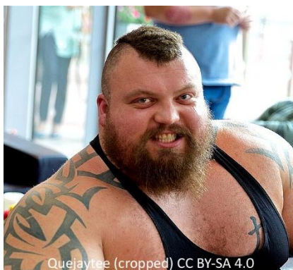
8 Eddie Hall