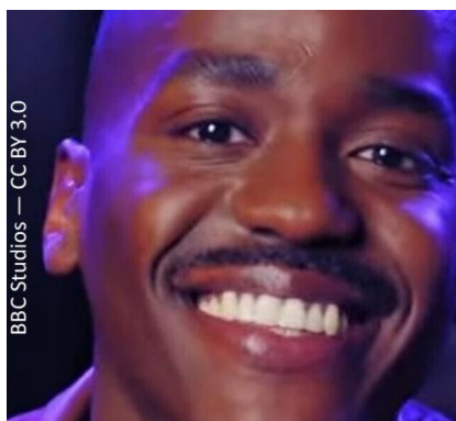
11 Ncuti Gatwa