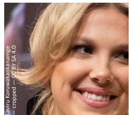
12 Millie Bobby Brown