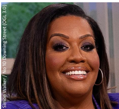
7 Alison Hammond