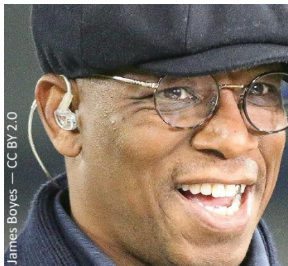
5 Ian Wright