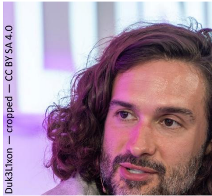
2 Joe Wicks