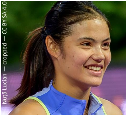
1 Emma Raducanu