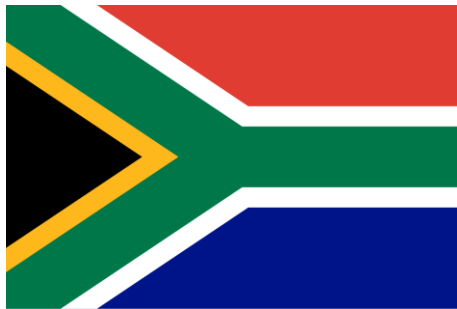
5 South Africa