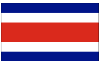
17 Costa Rica