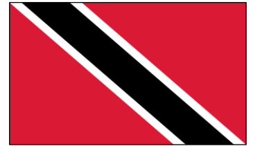
8 Trinidad and Tobago