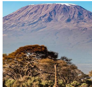
11 Mount Kilimanjaro