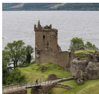
18 Loch Ness