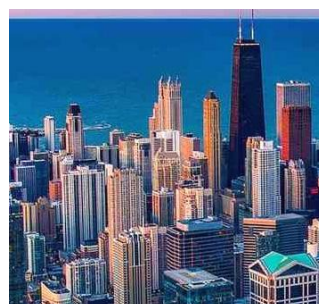
19 Lake Michigan