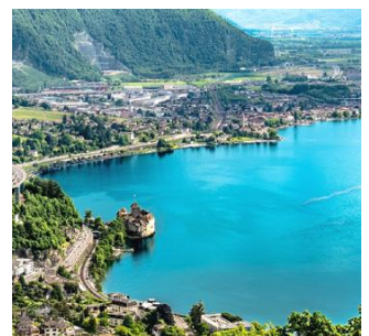
16 Lake Geneva