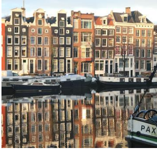
1 River Amstel

Name: 1-7 rivers, 8-15 mountains and 16-20 lakes