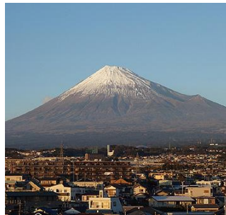
10 Mount Fuji