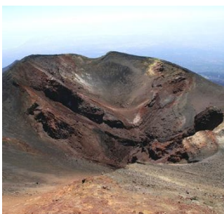
13 Mount Etna