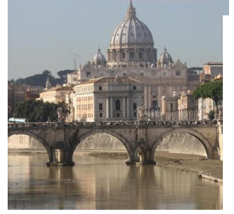
4 Tiber River