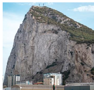
15 Rock of Gibraltar