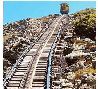
12 Snowdon (Welsh: Yr Wyddfa)