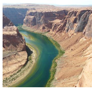
3 Colorado River