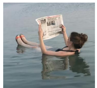
20 Dead Sea