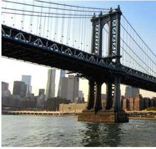
5 East River