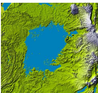
17 Lake Victoria