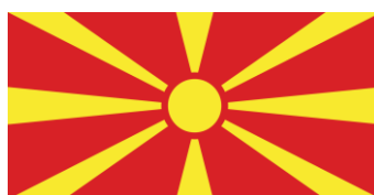
19 North Macedonia