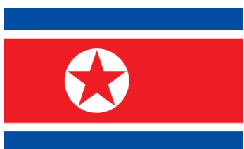
17 North Korea