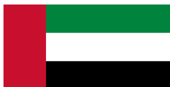
11 United Arab Emirates