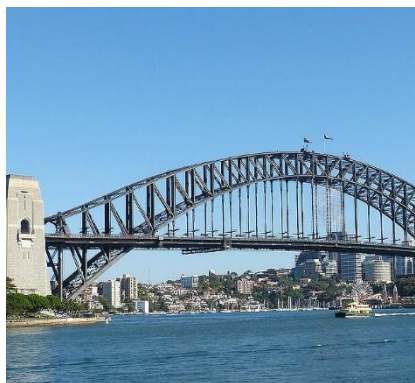
11 Sydney Harbour Bridge