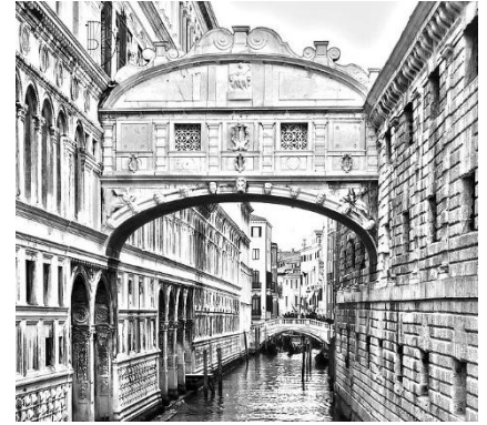
3 Bridge of Sighs, Ponte dei Sospir