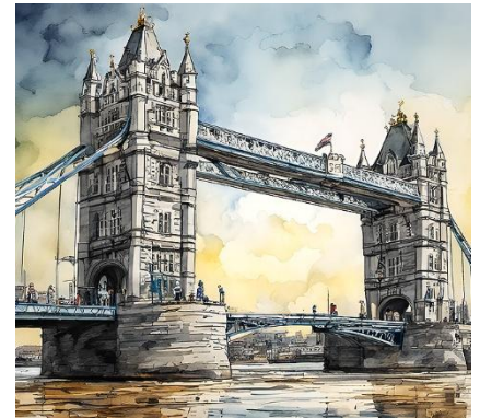
6 Tower Bridge