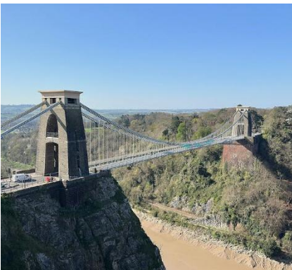
7 Clifton Suspension Bridge