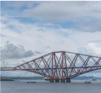
4 Forth Bridge