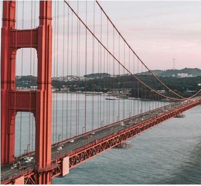
1 Golden Gate Bridge