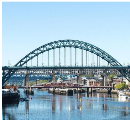
8 Tyne Bridge