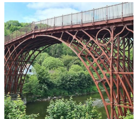
12 Iron Bridge