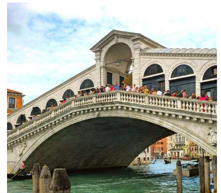
9 Rialto Bridge, Ponte de Rialto