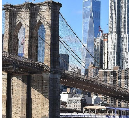
2 Brooklyn Bridge