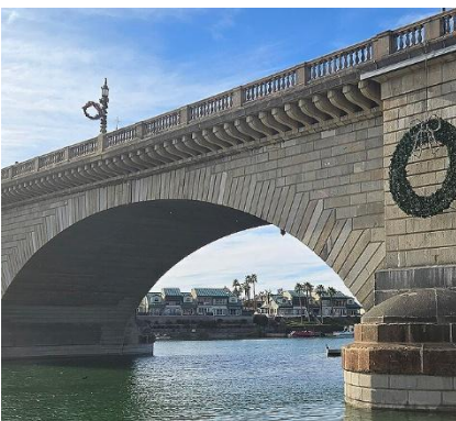
10 London Bridge