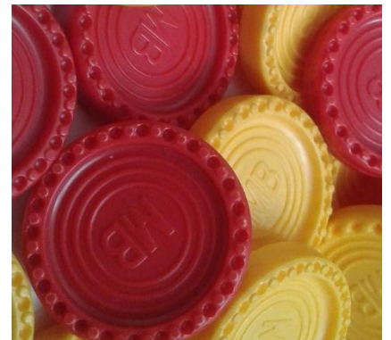
9 Connect 4