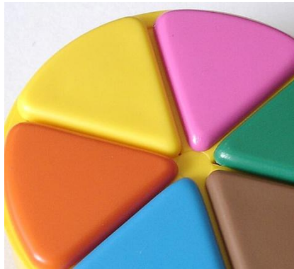
5 Trivial Pursuit