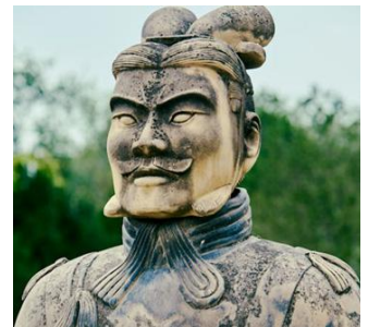
12 Terracotta Army Warrior