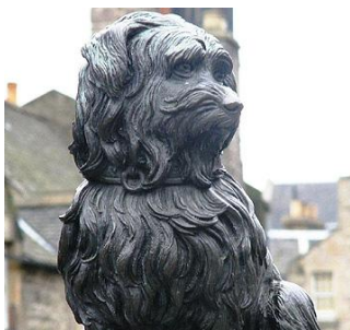
13 Greyfriars Bobby