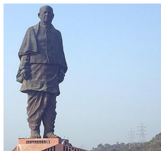
18 Statue of Unity