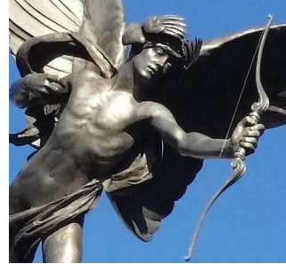
7 Eros (Shaftesbury Memorial Fountain)