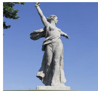
19 The Motherland Calls