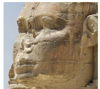
16 Great Sphinx of Giza