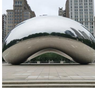
6 Cloud Gate