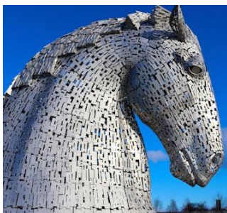
17 The Kelpies