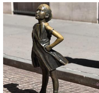
15 Fearless Girl