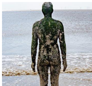
14 Another Place