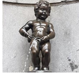
3 Manneken Pis