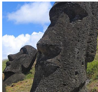
10 Moai statues