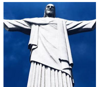
20 Christ the Redeemer