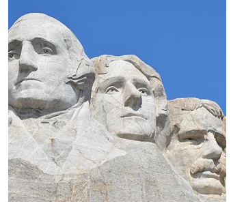
4 Mount Rushmore