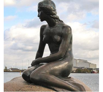
8 The Little Mermaid